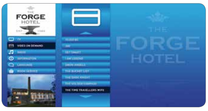
Example of TRIAX Middleware GUI on TV

The GUI gives end-users access to a wide range of content from a full television and radio service to movies, guest information, local weather reports, App's, and much more.